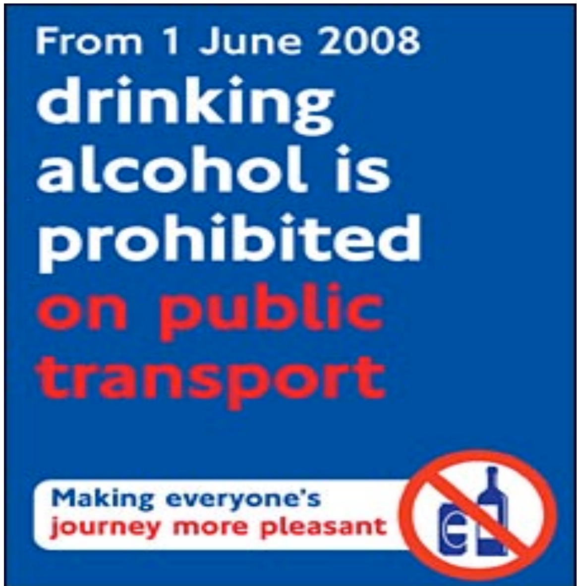
“Johnson bans drink on transport” (BBC News, 2008b)