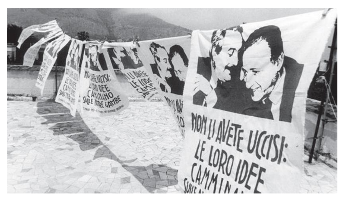
Figure 2.2 – Popular Anti-Mafia banners (Galullo, 2017) "You have not killed them: their ideas walk with our legs"

of locals prompted Sicilians to expose sheets and banners with anti-Mafia motto in the streets and outside their houses (Alajmo, 2015). This was possibly based on the rationale that, if one person alone could not fight Cosa Nostra, the whole street or neighbourhood had better chances to reach such goal through widespread protests.